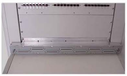
Custom Front Panel Interface