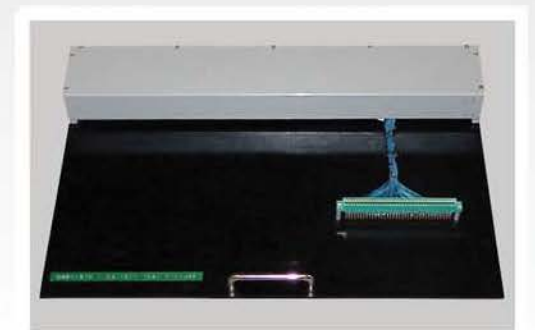
Front View of a Board Test Fixture