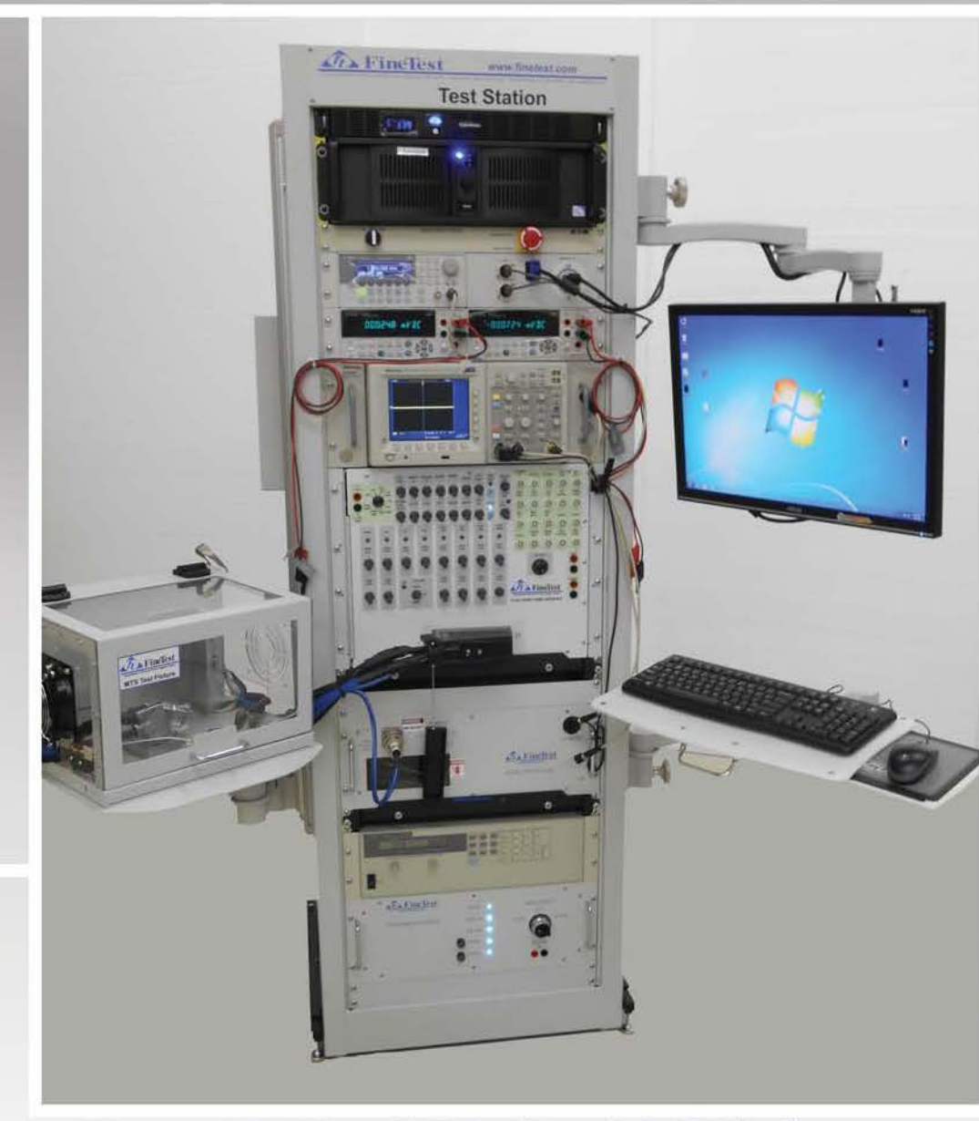
Front view of Avionics Manual Test Station #1

Application: Avionics Manual Test Station