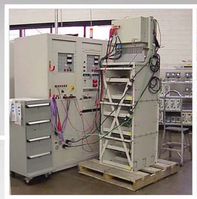
Tester #2 on Production Floor