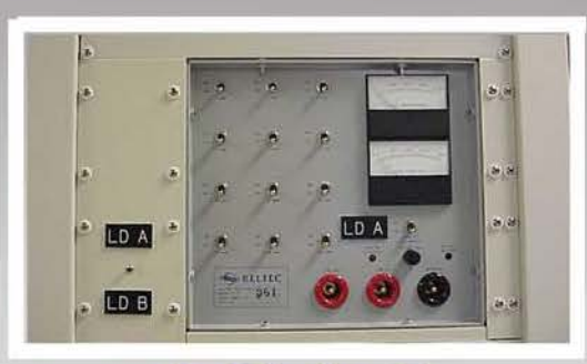
Resistive Load A