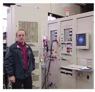
Manual Tester #1