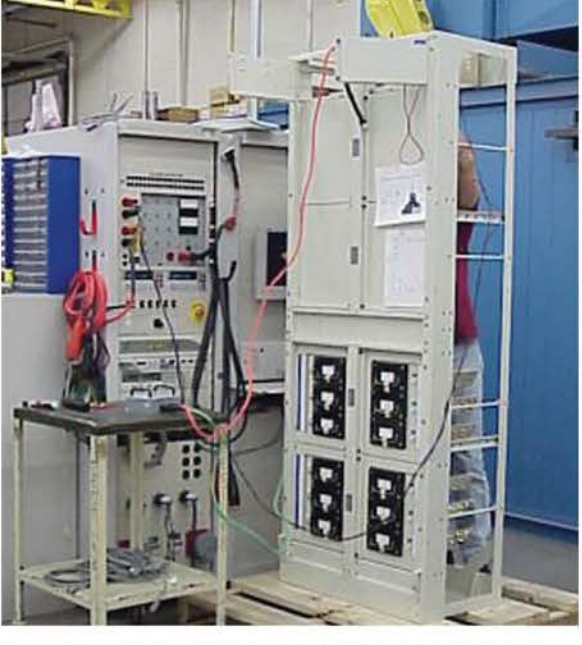
Testing a Power Cabinet in Production