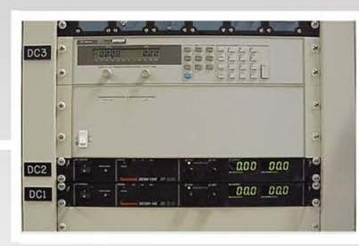
AC and DC Sources