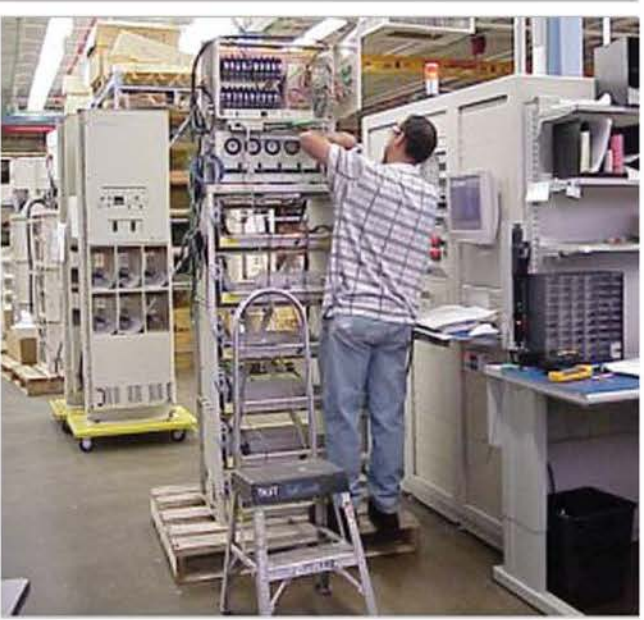
Connecting a Power Cabinet for Test