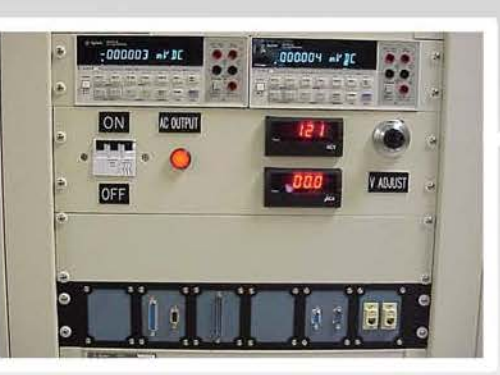
DMMs, AC Adjust, On/Off, & Meters