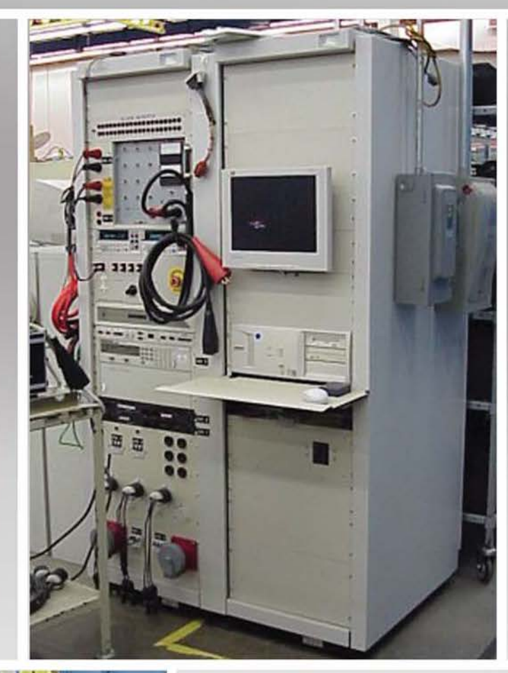
Cabinet Tester in Production