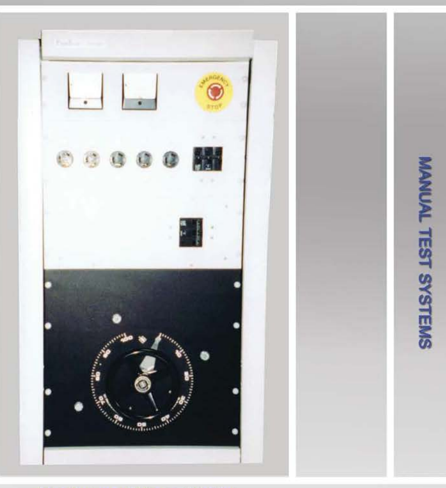
Front view of Manual Tester

Application: Repair Bench Test Production Test