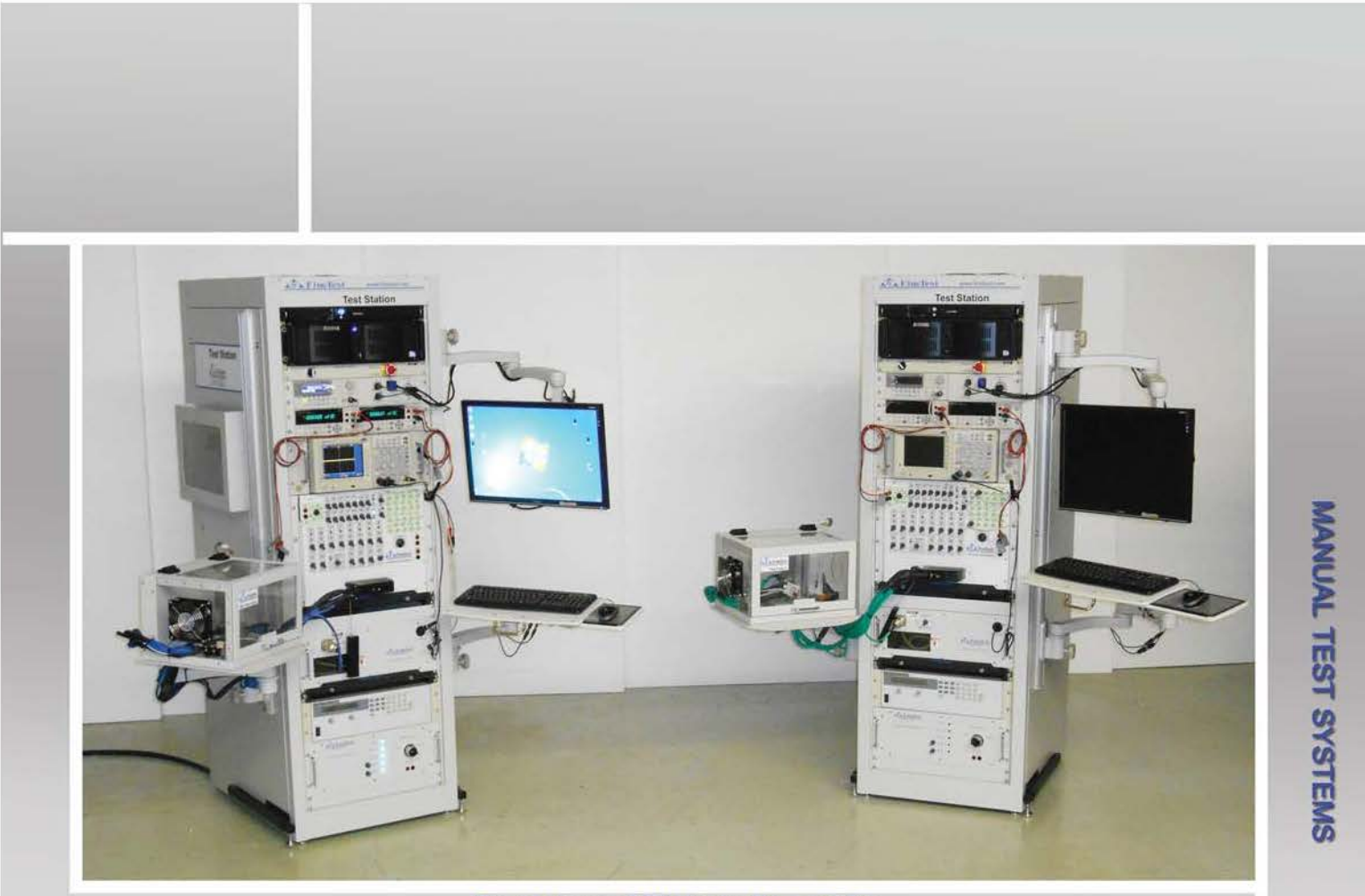
Front view of Stations #1 and #2