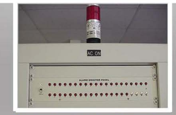
Flashing Lamp and UUT Alram Panel