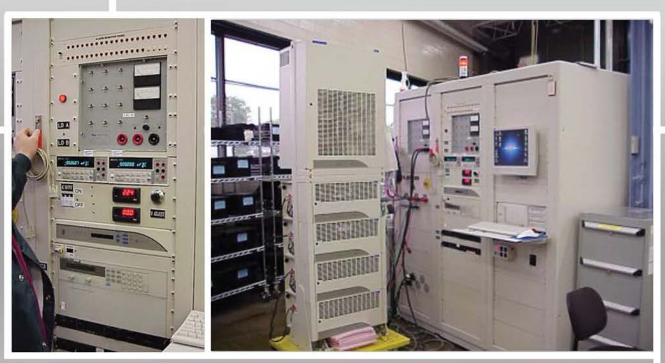
Manual Adjust of Equipment